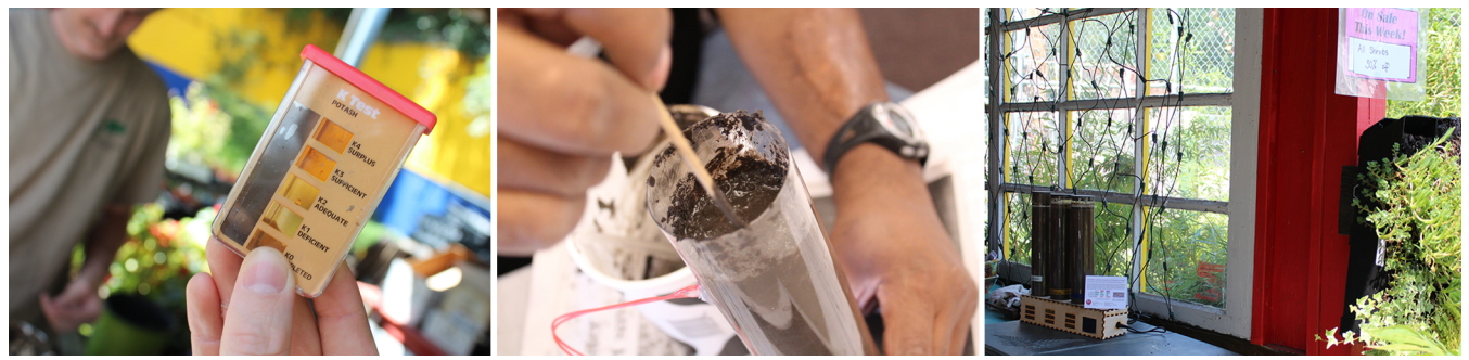
Figure 4. Community soil workshops: using a potassium test kit, mixing column contents, sensing system placed by cash register.